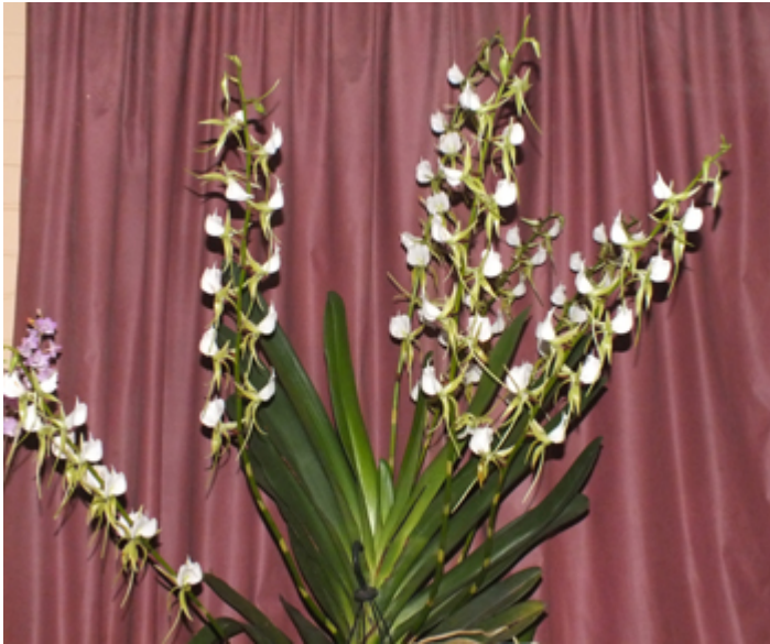
Plant of the Night June 2018 Angcm. eburneum (J Chow)