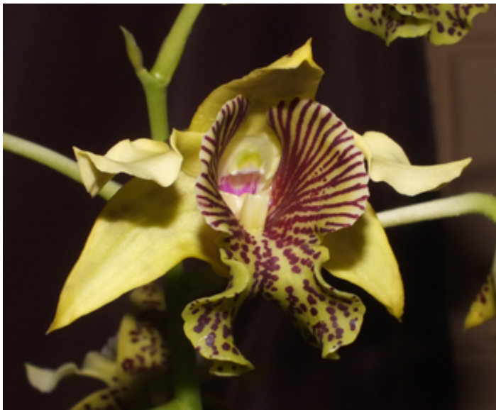
Den. macrophyllum x tapiniense