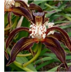
tracyanum FCC RHS