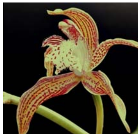
paler, common form