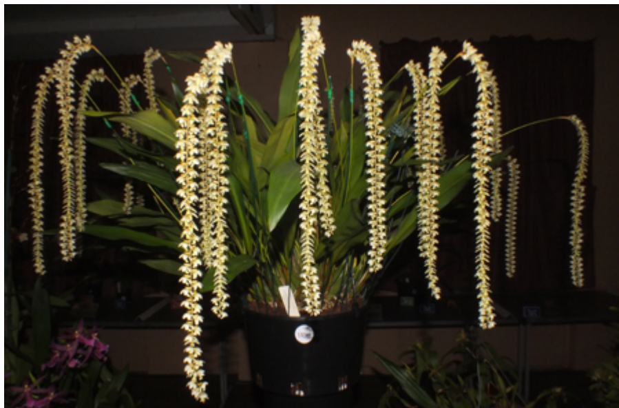
Ddc. cobbianum (D Mitsios - Plant of the Night in May, 2017)

Note: Williams Orchid Growers Manual Edition 7 can be read online at biodiversity library – just google the book name.