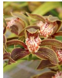
clone at Royale