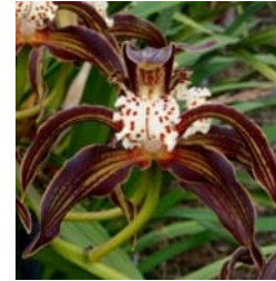
tracyanum FCC RHS