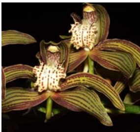
fairly typical, good form

Below are 10 different clones of tracyanums: