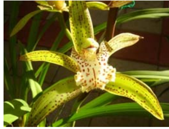
nearly green form