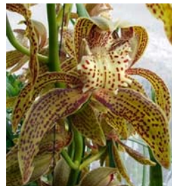
unusual spotted form