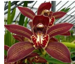
Pywacket Heathrich Hills

Pywacket is another "different" orchid. Its parents are Tethys and tracyanum. Tethys was famous in its day for the dark colour of many clones, and it's very dark lips. It was bred from earlier dark red Cymbids like Khyber Pass, and Volcano. Again, we don't know which clones the hybridist used, but the samples at the right give you a fair idea of what was involved. "Brenda Starr" was maybe the darkest of the Tethys but most had that fantastic full red lip you see in Brenda Starr. I would imagine that crossing Tethys with tracyanum might have been expected to intensify the red colours before further crosses were used to improve shape, but I am only guessing. Perhaps Mr Easton had already imagined the wonderful dark, spotty, but open flowers Pywacket delivered.